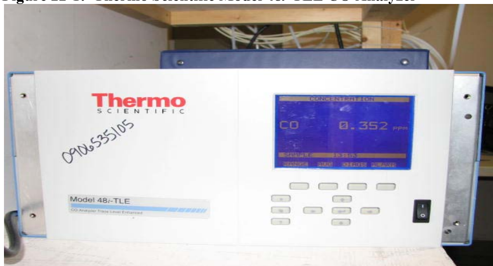
Figure 22-1: Thermo Scientific Model 48i-TLE CO Analyzer

The Thermo Scientific Model 48i-TLE Enhanced Trace Level CO analyzer (Figure 22-1) is an improved version of the standard Model 48i Ambient CO analyzer (U.S. EPA Designation Method RFCA-0981-054). The primary modifications to the Model 48i-TLE analyzer that improve its sensitivity over the Model 48i include the use of higher reflectance gold-coated mirrors, incorporation of a baseline auto-zeroing function, and the implementation of \pm 1 C control of optical bench temperature. The recommended operating temperature for the instrument ranges from 20°C to 30°C, but the Model 48i-TLE CO analyzer can be operated over the range of 5°C to 45°C. The Model 48i-TLE CO analyzer has an LDL of 0.02 ppm. Data can be provided in analog or digital formats.