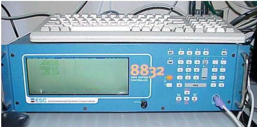
Figure 22-2: The Agilaire Model 8832 Data Logger

Write down any maintenance that was performed on the instrument or additional comments that may affect the air monitoring system. Examples include: