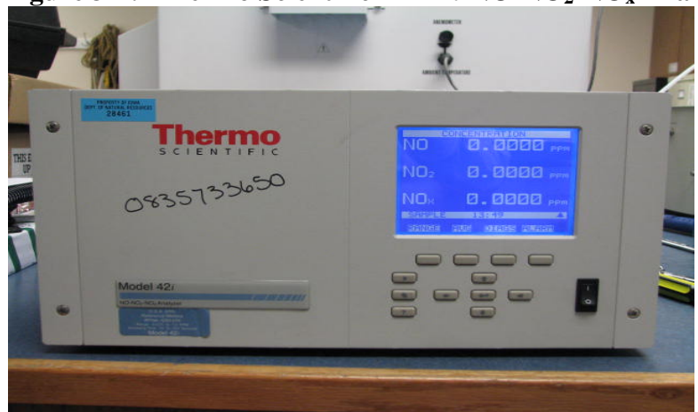
Figure 3-1: Thermo Scientific TL-42 i NO-NO<sub>2</sub>-NO<sub>x</sub> Analyzer

The Thermo TL-42 i runs on an external twin-head vacuum pump. Connect the pump vacuum port (inlet) to the Exhaust bulkhead. Connect the pump exhaust to a suitable vent or charcoal scrubber.