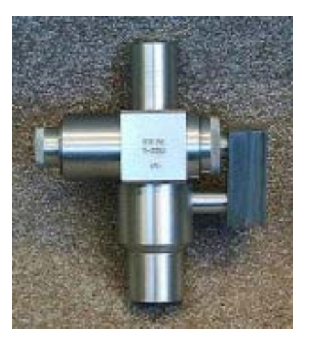
Figure 4-1: Very Sharp Cut Cyclone (VSCC) Used for PM2.5 Sampling

Figure 4-2 is a schematic drawing showing the inlet head of the PM2.5 and PM10 samplers. The inlet is designed to remove particles with aerodynamic diameter greater than 10 \mu m and to send the remaining smaller particles to the next stage. The design flow rate through the inlet is 16.7 liters per minute.