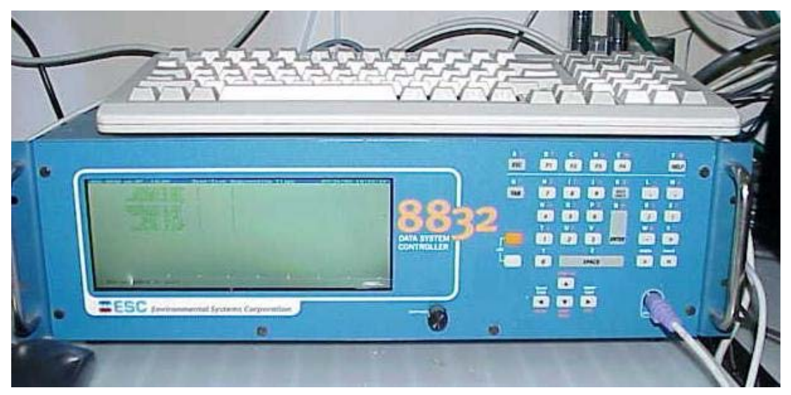
Figure 22-2: The Agilaire Model 8832 Data Logger

Write down any maintenance that was performed on the instrument or additional comments that may affect the air monitoring system. Examples include: