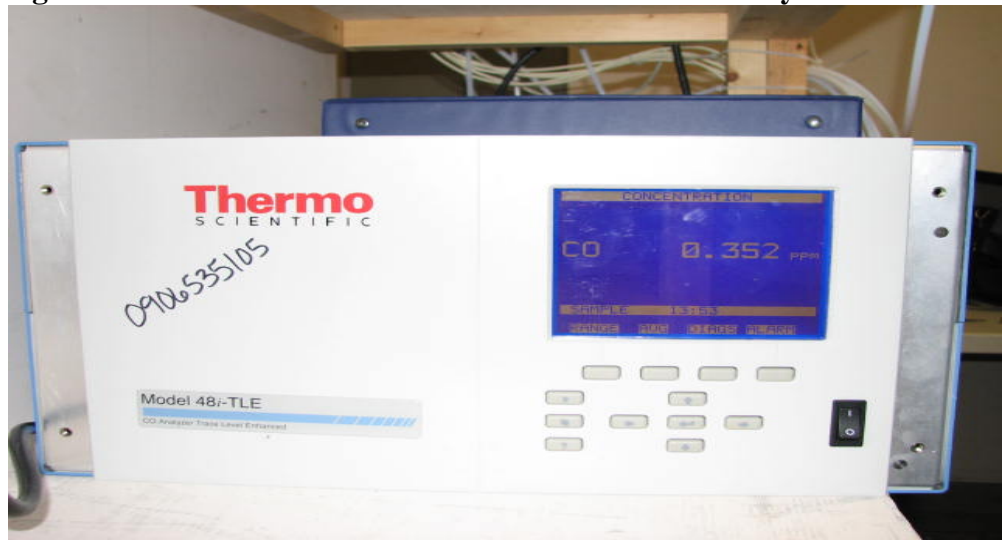
Figure 22-1: Thermo Scientific Model 48 i -TLE CO Analyzer

The Thermo Scientific Model 48 i -TLE Enhanced Trace Level CO analyzer (Figure 22-1) is an improved version of the standard Model 48 i Ambient CO analyzer (U.S. EPA Designation Method RFCA-0981-054). The primary modifications to the Model 48 i -TLE analyzer that improve its sensitivity over the Model 48 i include the use of higher reflectance gold-coated mirrors, incorporation of a baseline auto-zeroing function, and the implementation of \pm 1C control of optical bench temperature. The recommended operating temperature for the instrument ranges from 20°C to 30°C, but the Model 48 i -TLE CO analyzer can be operated over the range of 5°C to 45°C. The Model 48 i -TLE CO analyzer has an LDL of 0.02 ppm. Data can be provided in analog or digital formats.