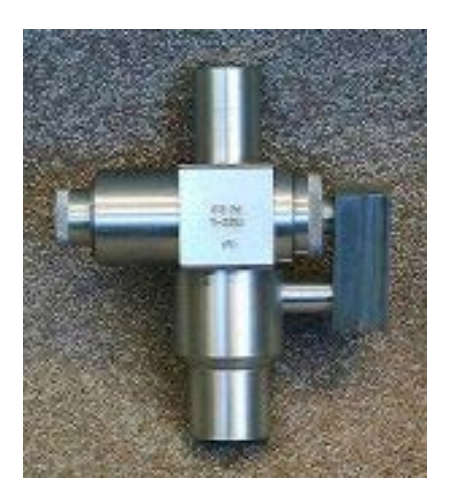
Figure 4-1: Very Sharp Cut Cyclone (VSCC) Used for PM2.5 Sampling

Figure 4-2 is a schematic drawing showing the inlet head of the PM2.5 and PM10 samplers. The inlet is designed to remove particles with aerodynamic diameter greater than 10 \mu m and to send the remaining smaller particles to the next stage. The design flow rate through the inlet is 16.7 liters per minute.