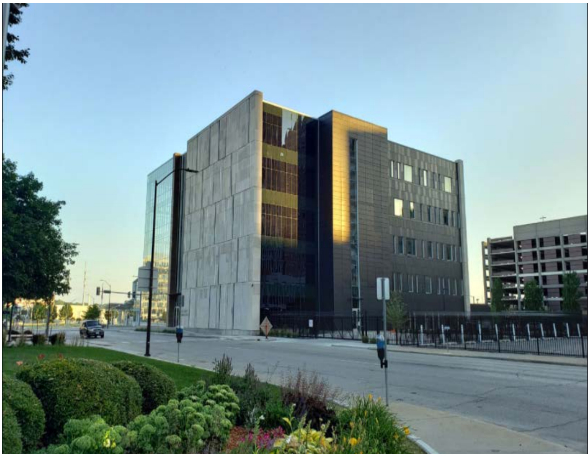
Polk County Criminal Court Building