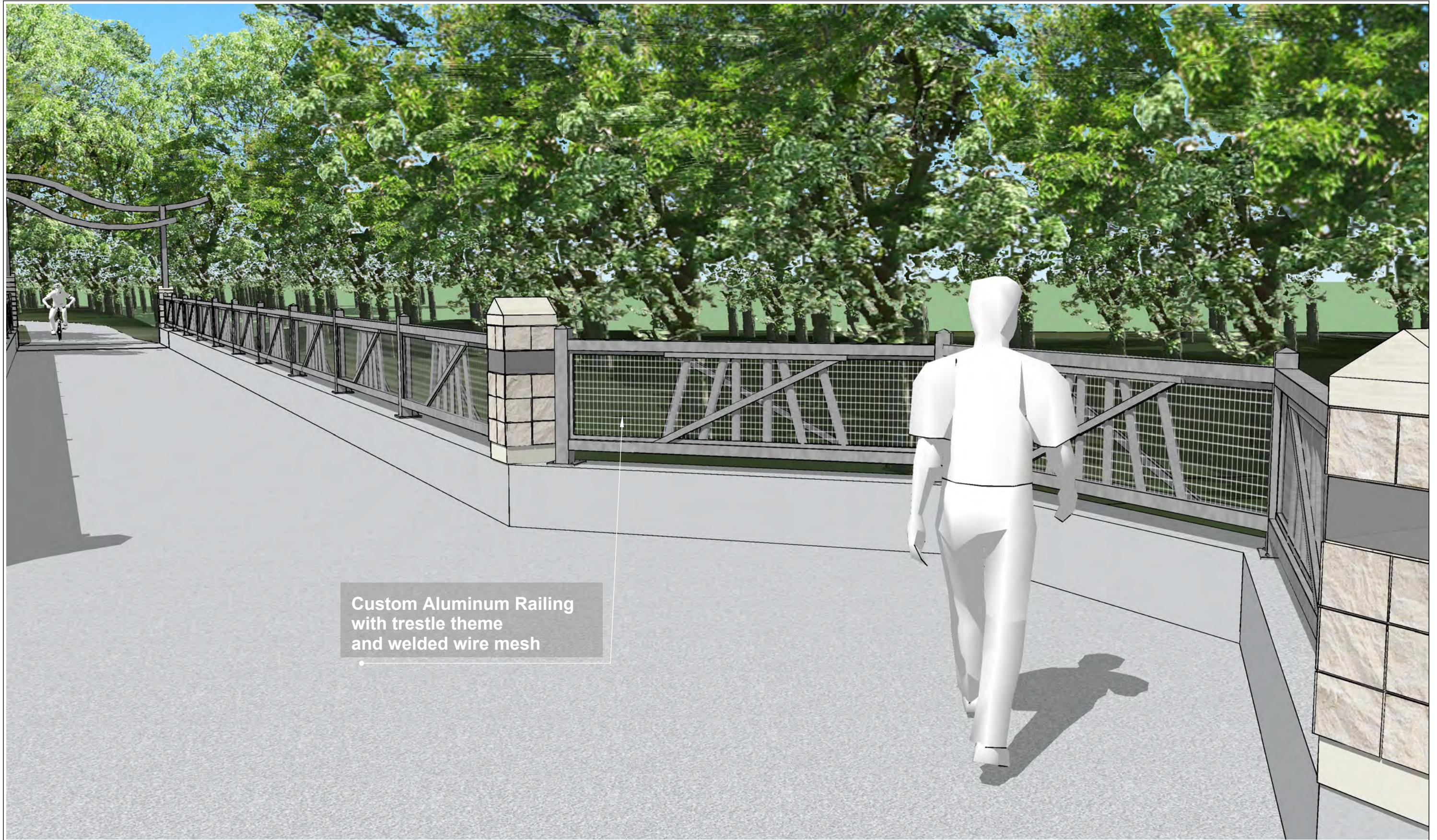
Custom Aluminum Railing with trestle theme and welded wire mesh