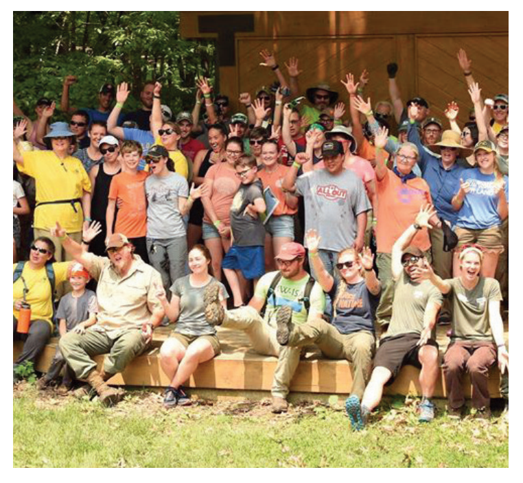
2019 National Trails Day participants posing for a photo at Jester Park.