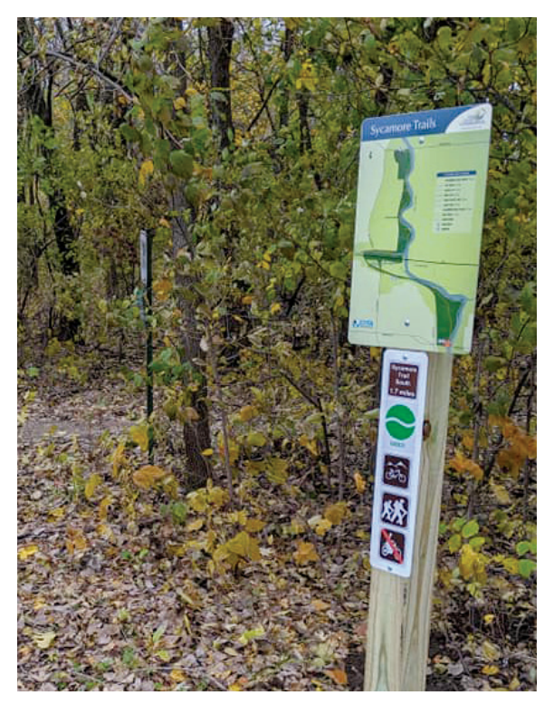
New trail signage along a key point of interest at Sycamore Trails.

In partnership with CITA (Central Iowa Trail Association), updated trail signage was installed on key points of access along the trail.