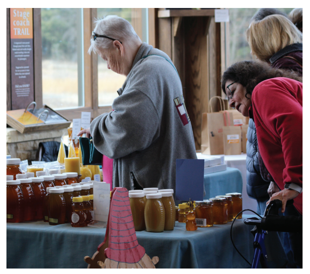
Guests shopping for local honey and other products at the First Annual Makers Market at the Jester Park Nature Center.

Polk County Conservation hosted the first Annual Fall Makers Market – Locally Grown, Raised, and Created at the Jester Park Nature Center on November 24. The market was comprised of 30 local vendors from the surrounding area who showcased their talents. More than 1,000 visitors attended the free event and were able to shop for gifts, food items, roast marshmallows, and explore Jester Park.