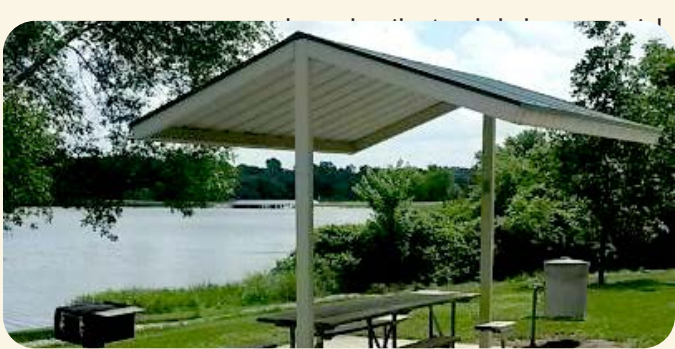
WOOD OR STEEL SHADE STRUCTURES: $15,000 - 20,000

Offer new experiences and perspectives to both classroom and recreational learners alike with the gift of a bird blind. Blinds offer benefits to wildlife by presenting undisturbed viewing opportunities, and to the observer with a comfortable viewing area sheltered from the elements.